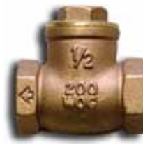
1/2" Check Valve T4-1/2 CV