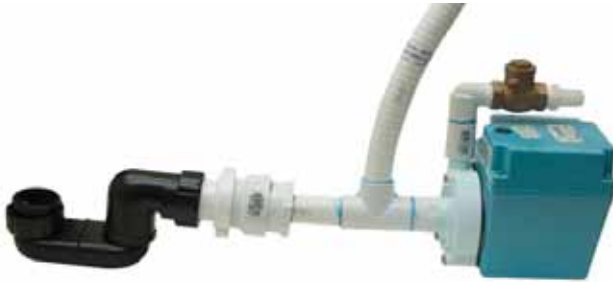
Little Giant Drain Pump Assembly T4-DP