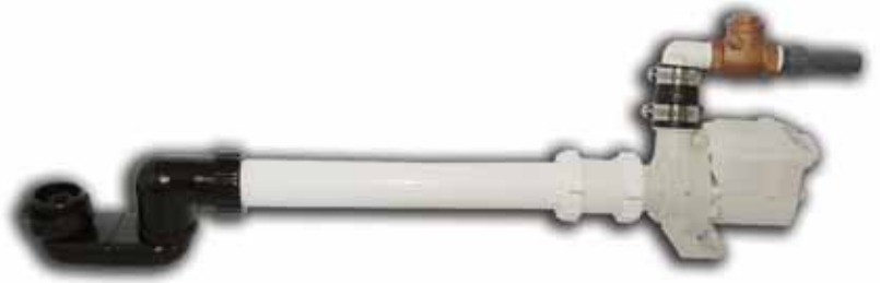
T 4 Drain Pump Assembly T4-DPH