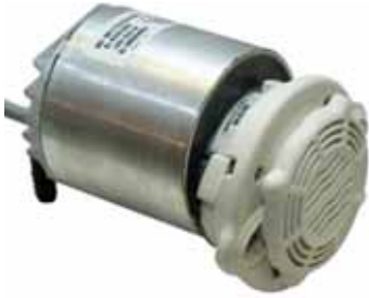
Geni Jet 120 V T4-GJ

Powerful pipe free motor pulse jet. Air venturi. Easy to clean.