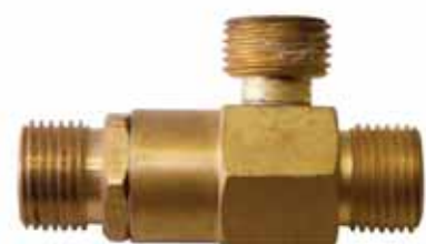
1/2" Diverter Tee T4-DT