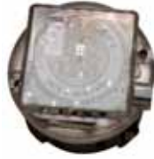
Dry End (includes motor and board) T4-SSD