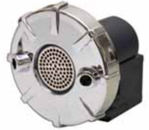
D29 Jet 120V/85W T4-D29

Jets are angled to 29° for precise whirlpool action.