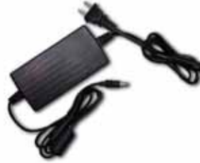
Transformer 24W DC T4-SST

New Technology. Works with spa liners. No drilling necessary.