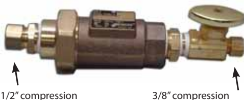
Dual Check Valve T4-DCV