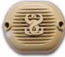
Wet End T4-SSW